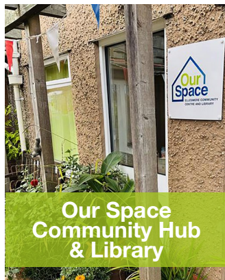
Our Space Community Hub & Library

As you can imagine, it's been all hands on deck for Blossom Barns this summer!